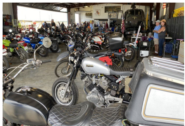
Commemorative Air Force Rally 2023