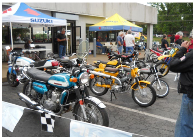
Recent Donnell's Rally and Show.