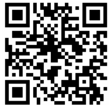
“This is what our web site home page looks like” KCVJMC.com